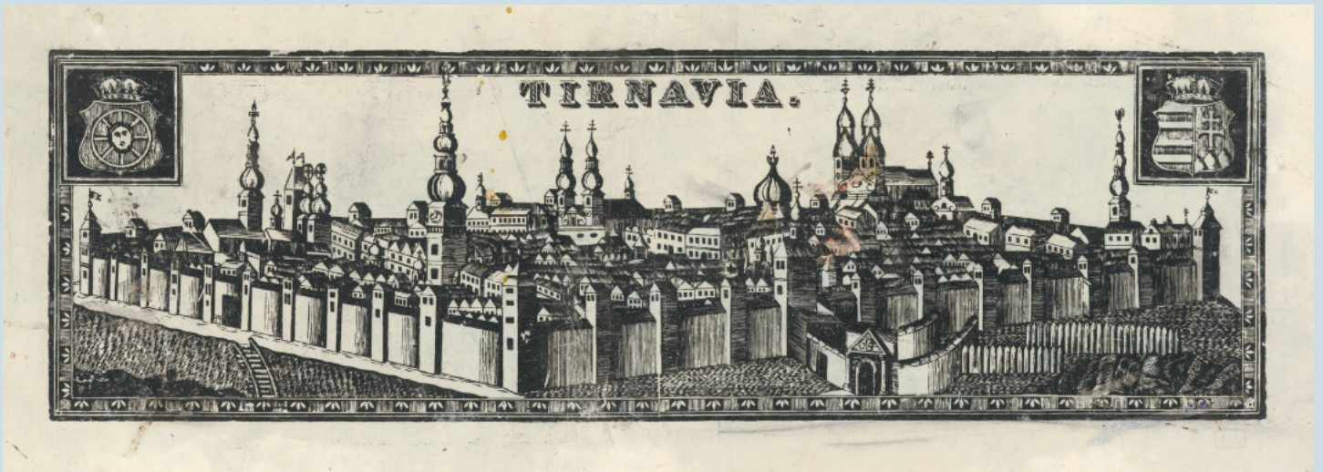
Slovak Engraver: View of Trnava, 1801–1850. Ernest Zmetak Art Gallery (SVK:GNZ.G_1387)

9:30 – 11:00 Guided tour of the historical centre with archeologist Erik Hrnčiarik